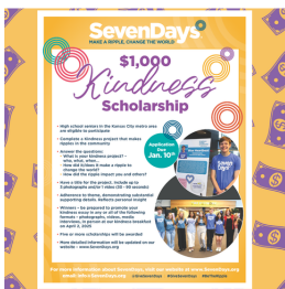
Seven Days Kindness Scholarship