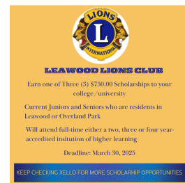
Leawood Lions Club Scholarship